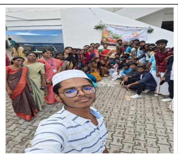
SPOKEN TUTORIAL: JULY 2023 TO DEC 2023

Spoken tutorial is a Free and Open source Software ensuring that anybody desire to learn, can learn from any place, at any time in a language of their choice. It is an online certificate course. Online tests were conducted semester wise. During the academic year 2023-2024 from July to December, nearly 522 students from all the departments were enrolled and benefited.