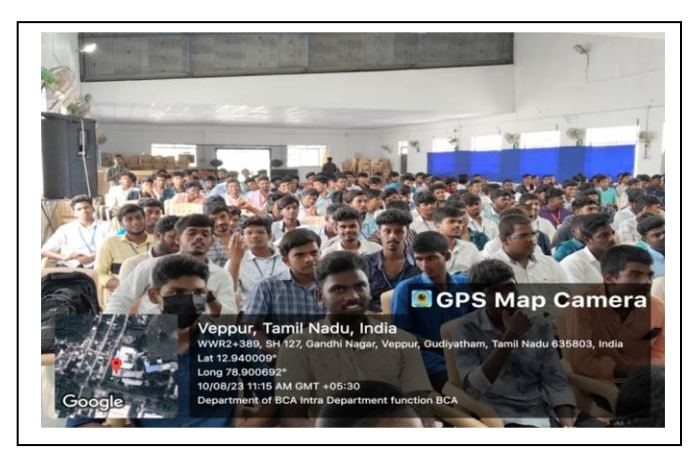
PAPERPRESENTATION, FLIM BATTLES, MEME MANIA, TECH QUIZ, MARKETING MINDS, VELADICTION